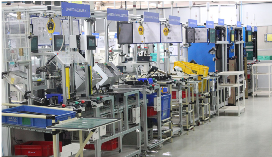
2W Mechanical DIS assembly line TVSM – Plant 1