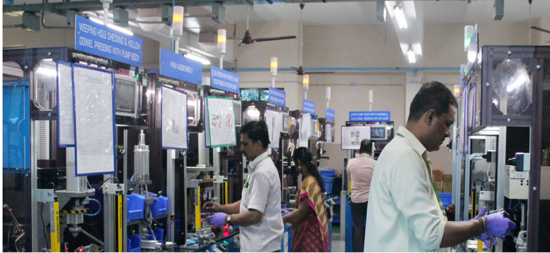
Oil & Water pump assembly line for BMW – Plant 3