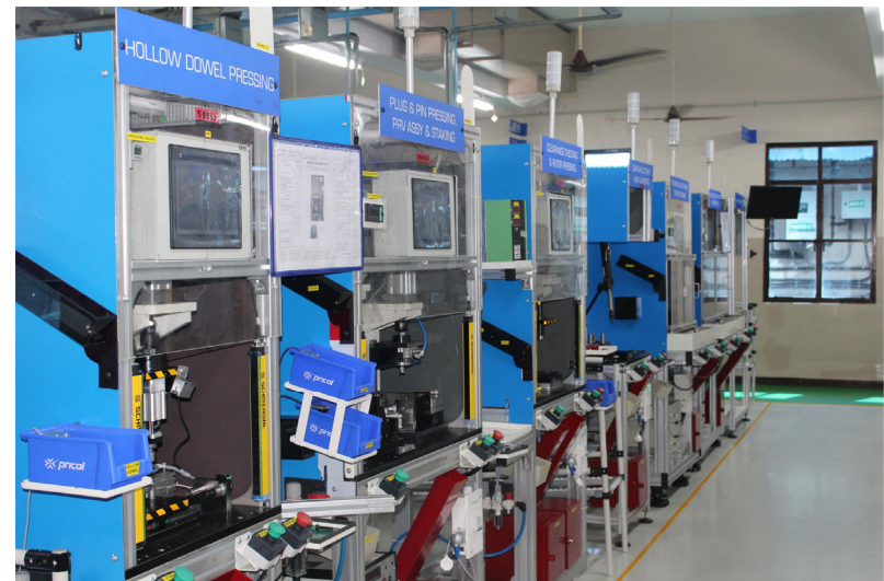
Oil pump assembly line for Generac – Plant 3