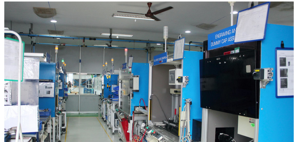
Cabin tilt system Cylinder assembly line for Ashok Leyland – Plant 3