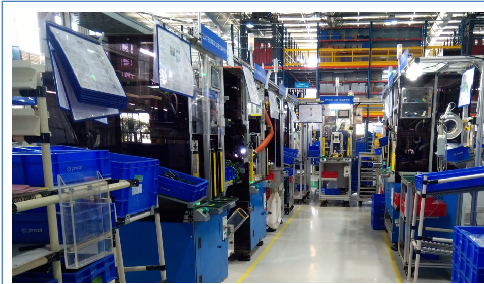
TFR FLS assembly line for REML – Plant 10