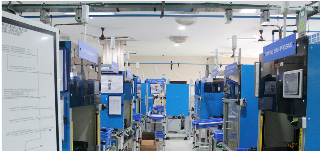
Cabin tilt system Pump assembly line for Ashok Leyland – Plant 3