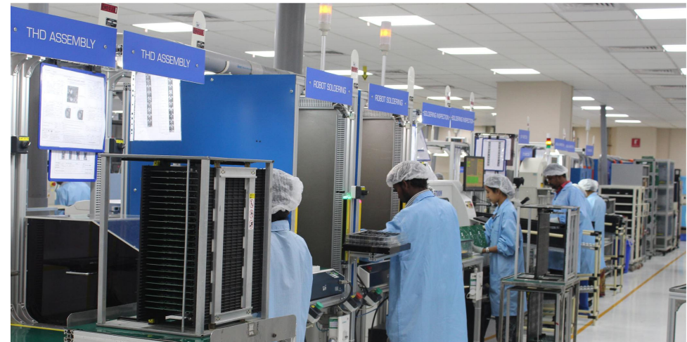
Through hole PCB assembly line – Plant 1