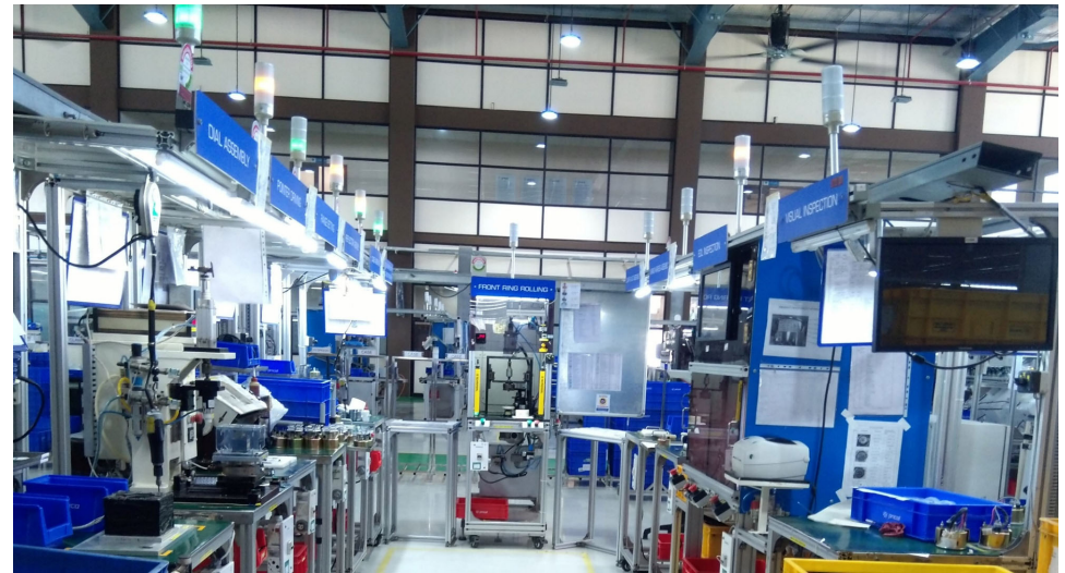
2W Mechanical DIS assembly line for REML – Plant 10